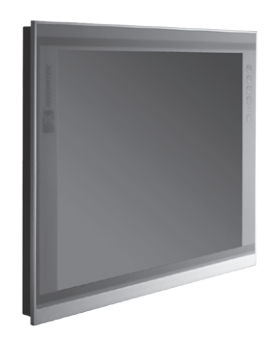
▲ Ultra-slim mechanism design