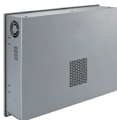
▲ Back view