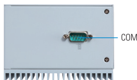
▲ Bottom view