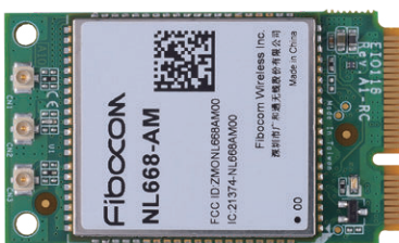
▲ AM_top view