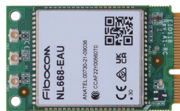
▲ EAU_top view