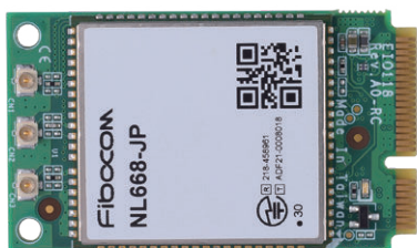
▲ JP_top view