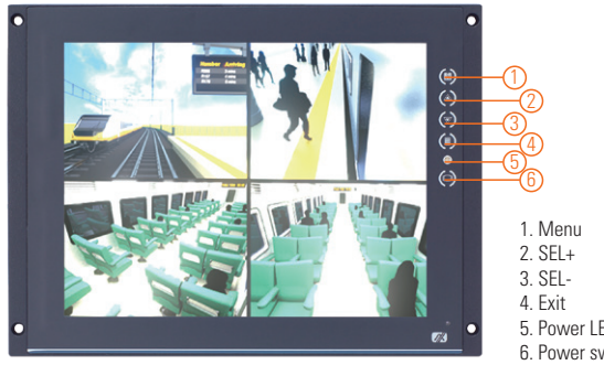
5. Power LED 6. Power switch