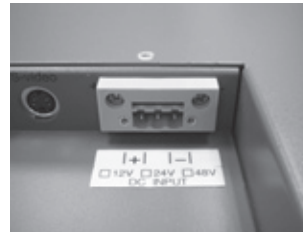
Phoenix-type power input

Touch Panel Computers for Various Industry Applications