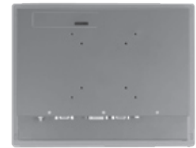
Various mounting ways Panel/Wall/VESA