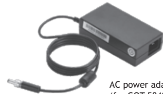
AC power adapter (for GOT-5840T-830-J)

Touch Panel Computers for Various Industry Applications