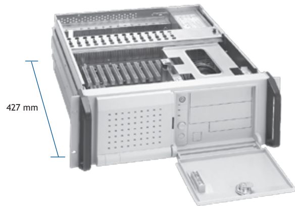
Designed for undersized rack