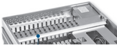
Hold-on clamp bar with adjustable clips to secure add-on cards in different height