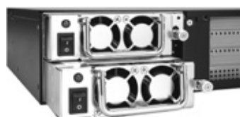
Optional hot-swap redundant power supply (only for AX61220TP)