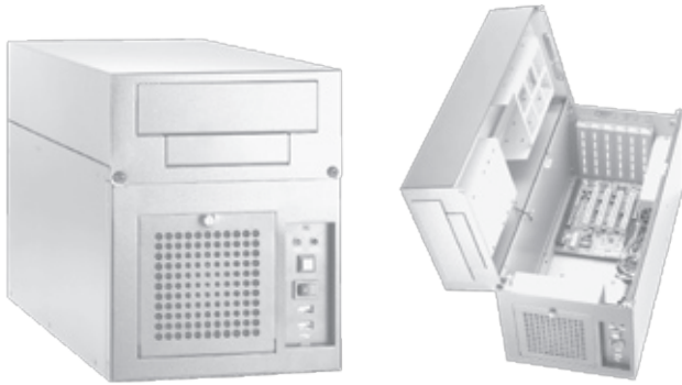
Flexible drive bay design for ease of maintenance